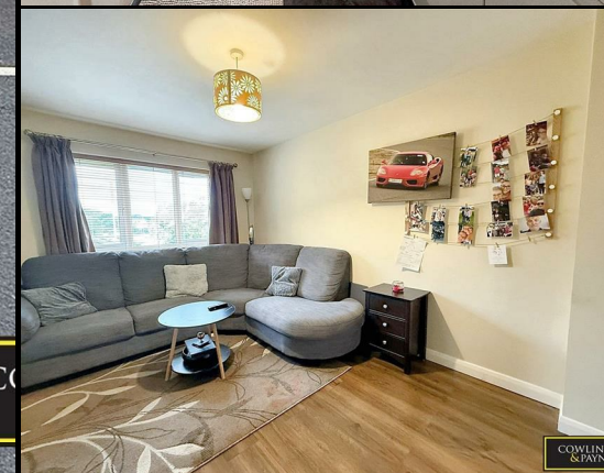
Cranfield Park Court, Wickford Guide Price £155,000